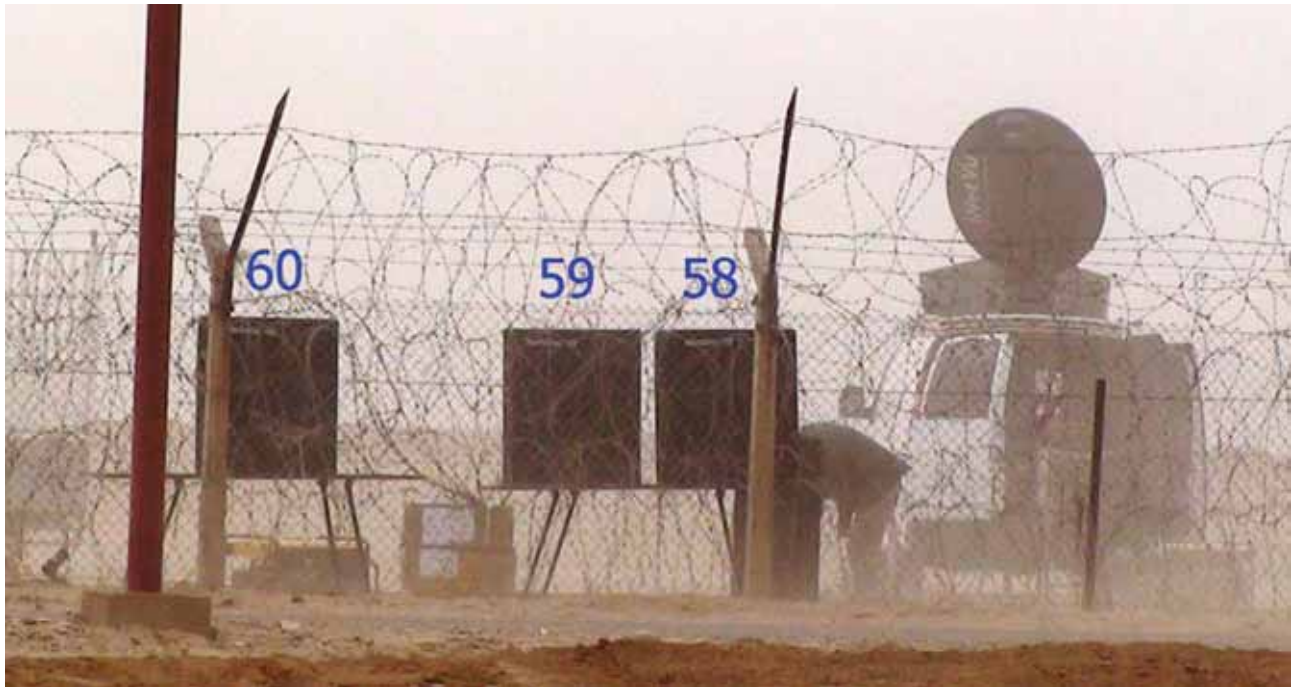
3 mobile loud speakers Camp Ashraf South Flank