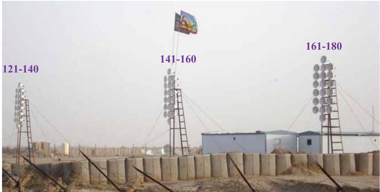
60 loudspeakers at Camp Ashraf East Flank (First point)