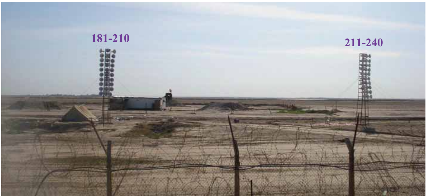
60 loudspeakers at Camp Ashraf east flank (second point)