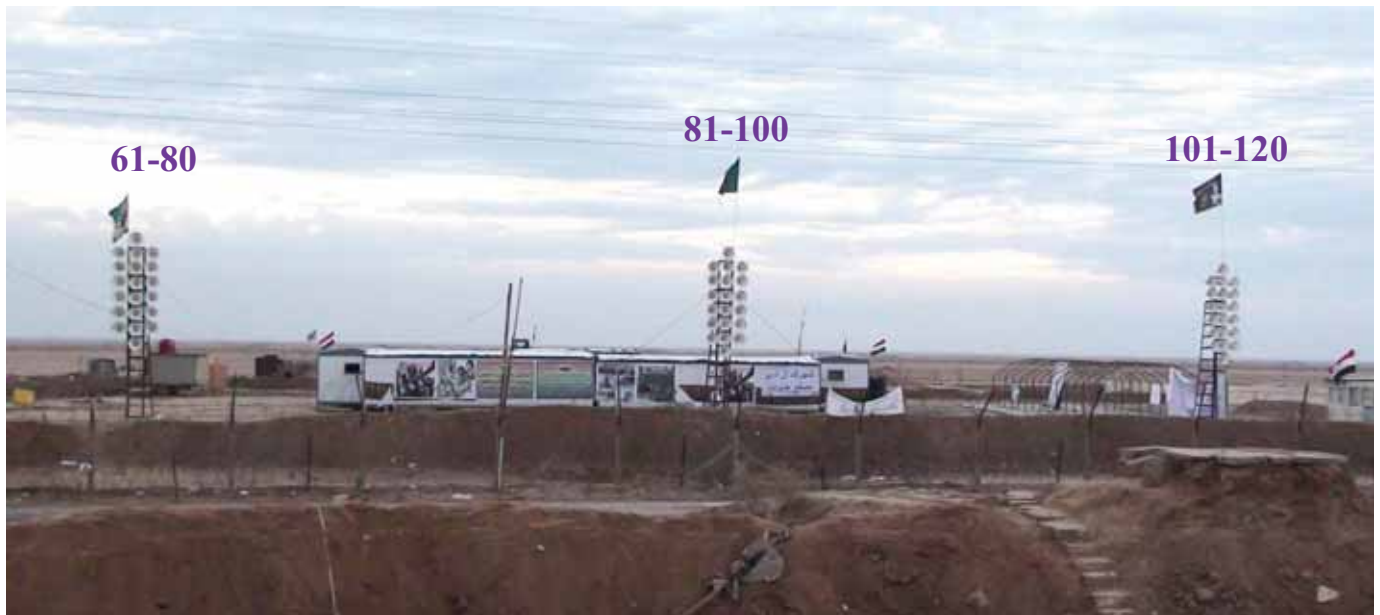
60 loudspeakers loud speakers Camp Ashraf South Flank

Total of 63 loud speakers at south flank of Ashraf