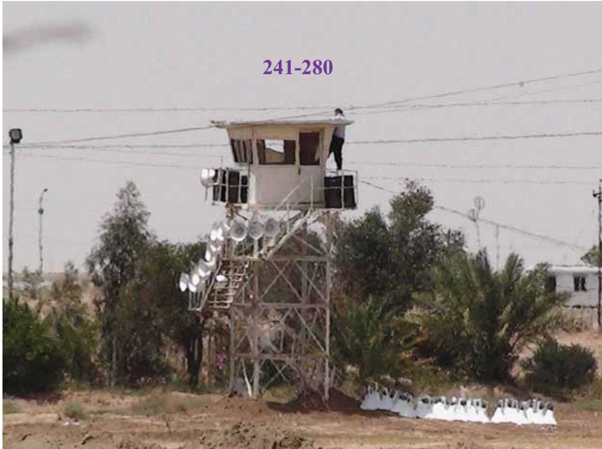
40 loudspeakers at Tulip square in center of Ashraf